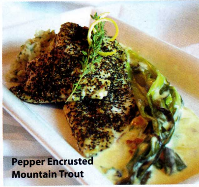
Pepper Encrusted Mountain Trout