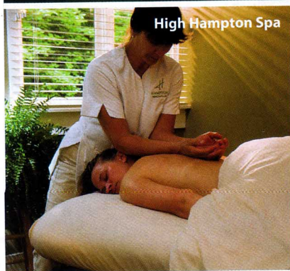
High Hampton Spa